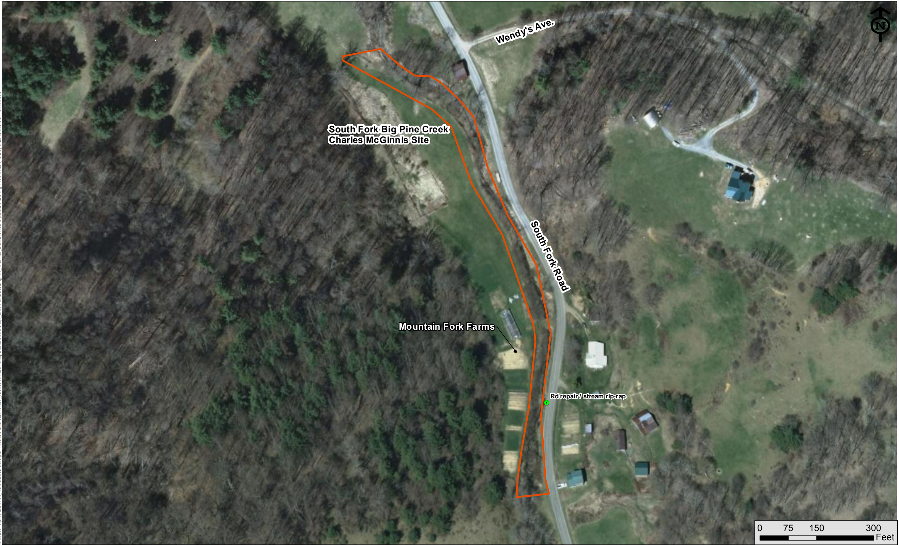
South Fork Big Pine Creek - Charles / McGinnis Site

D:\GIS\Projects\000166_NorthCarolinaDeptofTransportation\0217597_NCDOTStewardshipMonitoring\#9\map_docs\mxd\working\18_Charles_McGinnis_Site_(SouthForkBigPineCreek).mxd | Last Updated: 10.18.2013