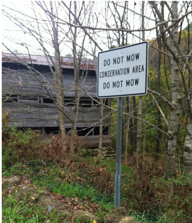
"Do Not Mow" signs