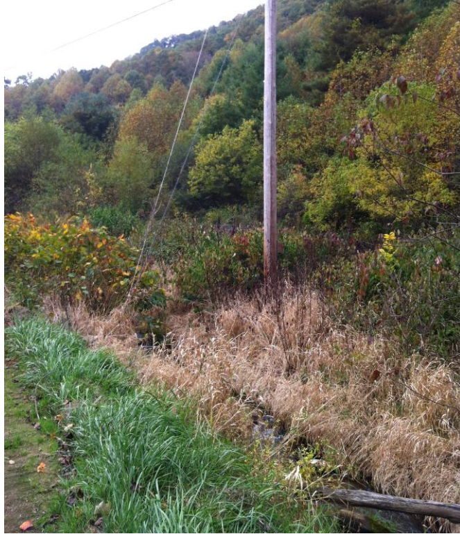
Evidence of herbicide spraying by utility company