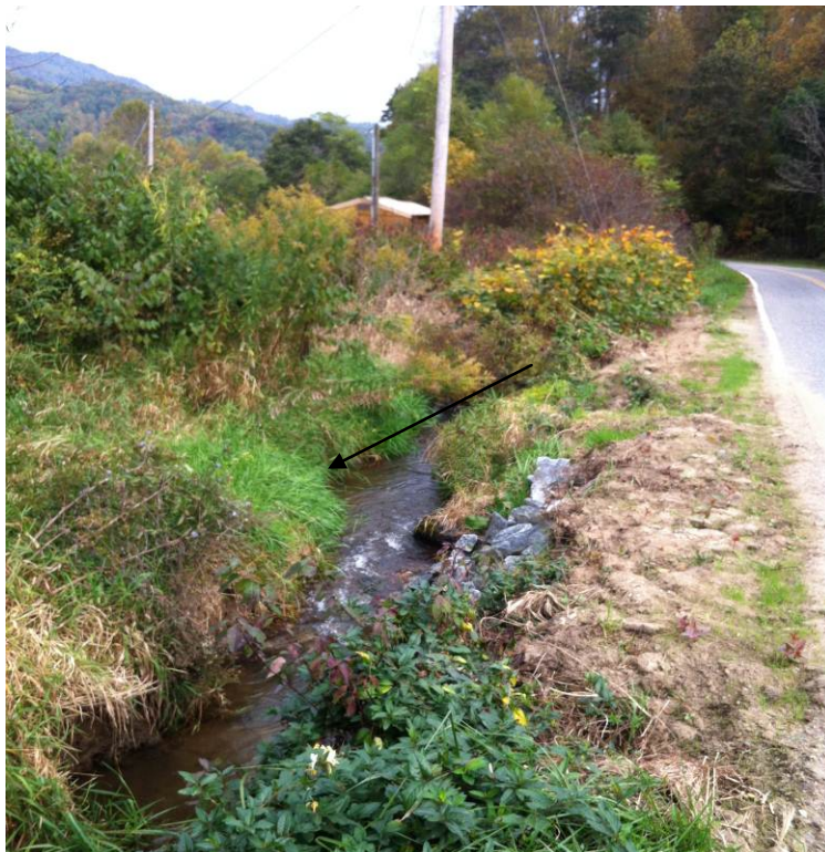
Evidence of stream side rip-rap additions and earth moving activities, honeysuckle in foreground