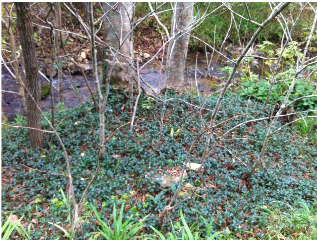
Bigleaf periwinkle seen in portions of the of stream banks